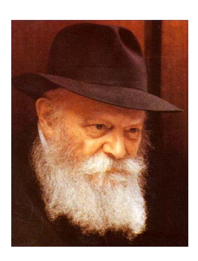
The Lubavitch Rebbe

The Hasidim, or 'pious ones' in Hebrew, belong to a special movement within Orthodox Judaism, a movement that in the first half of the nineteenth century, claimed the allegiance of millions in Eastern and Central Europe - perhaps a majority of East European Jews. Lubavitch is a world wide movement of Hasidic Jews centred in New York where its leader, the seventh Lubavitcher Rebbe, resided until his death in June 1994. For the past twenty years I have been researching their understandings of healing (Dein 2002).